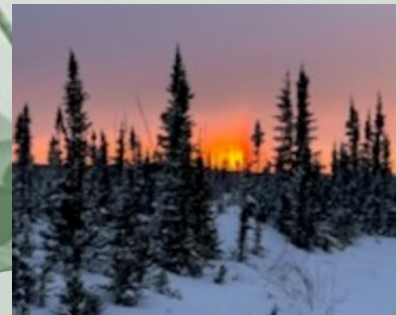
The beauty of Bistcho Lake .

Where no one intrudes, many can live in harmony.