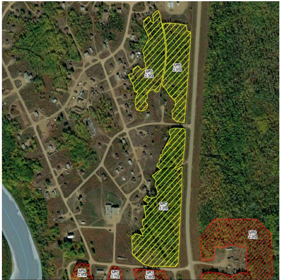
Firesmart activities will occur in areas outlined in yellow

Please be cautious of smoke as crews will also be burning debris in this area.